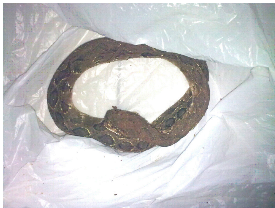
Fig 1—The brought-in Russell's viper ( Daboia russelii ).